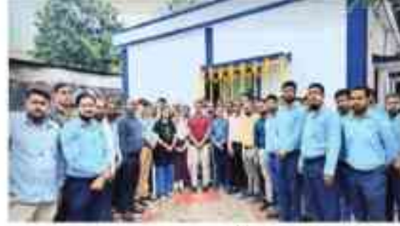
नए ग्राहक सेवा केंद्र के उद्घाटन के अवसर पर टीपीएसओडीएल के पदाधिकारी।

मलकानगिरी जिला, जो मुख्य रूप से आदिवासी रहता है,