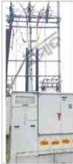
ଟିପିଏସ୍‌ଓଡିଏଲ୍ ପକ୍ଷରୁ ଲାଗାଣ୍ଟିଭ୍ ଟେକ୍ନିକ୍ସ ବ୍ୟବହାର କରାଯାଇଛି।

ପୁରୀ, ୨୯/୭ : ବିଦ୍ୟୁତ୍ ବିଭାଗ ଦ୍ୱାରା ଦିଗପହଣ୍ଡିର ଉତ୍ତମ ଟିପିଏସ୍‌ଓଡିଏଲ୍ ପ୍ରକଳ୍ପ ଚଳିତ ବର୍ଷ ଶେଷ ପର୍ଯ୍ୟନ୍ତ ସମାପ୍ତ ହେବାର ସମ୍ଭାବନା ରହିଛି। ଏହି ପ୍ରକଳ୍ପର ଅନ୍ତର୍ଗତ ୧.୬ କି.ମି. ଦୂରରେ ଥିବା ଚିକିଟି ଗ୍ରୀଡ୍ ସହିତ ଡିଗପାହଣ୍ଡି ନୋଟିଫାଇଡ୍ ଆରିଆ କାଉନ୍ସିଲ୍ (NAC) କୁ ଯୋଡ଼ିବା ପାଇଁ ଏକ ୩୩ କି.ଭି.ଭି. ବିଦ୍ୟୁତ୍ ଲାଇନ୍ ଗଠନ କରାଯାଇଛି। ଏହି ଲାଇନ୍ ଗଠନ ପାଇଁ ଟିପିଏସ୍‌ଓଡିଏଲ୍ ପକ୍ଷରୁ ଲାଗାଣ୍ଟିଭ୍ ଟେକ୍ନିକ୍ସ ବ୍ୟବହାର କରାଯାଇଛି। ଏହି ଲାଇନ୍ ଗଠନ ପାଇଁ ଟିପିଏସ୍‌ଓଡିଏଲ୍ ପକ୍ଷରୁ ଲାଗାଣ୍ଟିଭ୍ ଟେକ୍ନିକ୍ସ ବ୍ୟବହାର କରାଯାଇଛି। ଏହି ଲାଇନ୍ ଗଠନ ପାଇଁ ଟିପିଏସ୍‌ଓଡିଏଲ୍ ପକ୍ଷରୁ ଲାଗାଣ୍ଟିଭ୍ ଟେକ୍ନିକ୍ସ ବ୍ୟବହାର କରାଯାଇଛି।