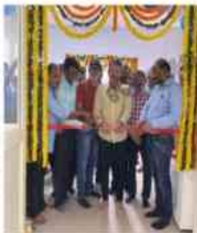
କୋରାପୁଟ, ୮ ଜୁଲାଇ (ଆରଏଚ୍) ଟିପିଏସ୍‌ଓଡିଏଲ୍ କର୍ମଚାରୀଙ୍କ ଉପସ୍ଥିତିରେ ନୂତନ ଅଫିସ୍ ବିନ୍ଦୁ ଉଦ୍ଘାଟିତ ହୋଇଛି। ଏହି ନୂତନ ଅଫିସ୍ କୋରାପୁଟ, ମାଲକାନଗିରି ଏବଂ କୋରାପୁଟରେ ନିର୍ମାଣ ହୋଇଛି। ଏହି ଅଫିସ୍ ବିଭିନ୍ନ ବାସ୍ତବ୍ୟ ସହ ସମନ୍ବିତ ସୁବିଧା ଉପଲବ୍ଧ କରିବାକୁ ଉଦ୍ଦିଷ୍ଟ ଅଟେ।

କୋରାପୁଟ, ୮ ଜୁଲାଇ (ଆରଏଚ୍) ଟିପିଏସ୍‌ଓଡିଏଲ୍ କର୍ମଚାରୀଙ୍କ ଉପସ୍ଥିତିରେ ନୂତନ ଅଫିସ୍ ବିନ୍ଦୁ ଉଦ୍ଘାଟିତ ହୋଇଛି। ଏହି ନୂତନ ଅଫିସ୍ କୋରାପୁଟ, ମାଲକାନଗିରି ଏବଂ କୋରାପୁଟରେ ନିର୍ମାଣ ହୋଇଛି। ଏହି ଅଫିସ୍ ବିଭିନ୍ନ ବାସ୍ତବ୍ୟ ସହ ସମନ୍ବିତ ସୁବିଧା ଉପଲବ୍ଧ କରିବାକୁ ଉଦ୍ଦିଷ୍ଟ ଅଟେ। ଏହି ଅଫିସ୍ କର୍ମଚାରୀଙ୍କ ଉପସ୍ଥିତିରେ ଉଦ୍ଘାଟିତ ହୋଇଛି। ଏହି ଅଫିସ୍ ବିଭିନ୍ନ ବାସ୍ତବ୍ୟ ସହ ସମନ୍ବିତ ସୁବିଧା ଉପଲବ୍ଧ କରିବାକୁ ଉଦ୍ଦିଷ୍ଟ ଅଟେ। ଏହି ଅଫିସ୍ କର୍ମଚାରୀଙ୍କ ଉପସ୍ଥିତିରେ ଉଦ୍ଘାଟିତ ହୋଇଛି। ଏହି ଅଫିସ୍ ବିଭିନ୍ନ ବାସ୍ତବ୍ୟ ସହ ସମନ୍ବିତ ସୁବିଧା ଉପଲବ୍ଧ କରିବାକୁ ଉଦ୍ଦିଷ୍ଟ ଅଟେ।