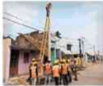
मानसून के दौरान विद्युत परिप्रेय सुचारु रखने के लिए तारी की जांच करते कर्मियों।

टीपीएसओडीएल ने छह सर्विसेजों में 5,925 स्कोपों की एक समर्पित टीम बनाई है, जिसमें आपदास्थलीय खदानों और अनिरीक्षित जनसंघित शामिल हैं। पेड़ों के